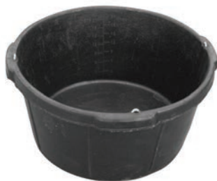
RT00248 6.5 GALLON RUBBER 3-LOOP PAN

General purpose pan. Made of safe, soft rubber. Features reinforced rim.