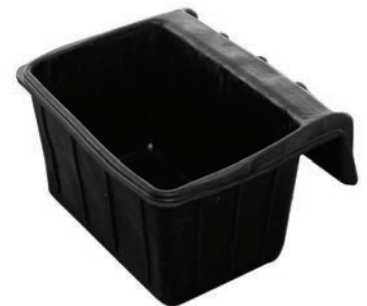
RT00255 16 QUART RUBBER HOOKOVER FEEDER

General purpose pan. Made of safe, soft rubber. Features reinforced rim and handles for easy carrying.