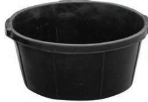
RT00241 6.5 GALLON RUBBER UTILITY TUB

Made of safe, soft rubber. Features handle for easier carrying. Nests tightly into corners.