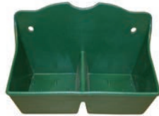
DT00117 1 QUART MINERAL FEEDER L 9.19" x W 5.56" x H 5.5"

Feeder holds standard 4 lb salt or mineral block. Raised ribs and drainage holes keep blocks dry. Contoured mounting plate has holes to allow for permanent mount.