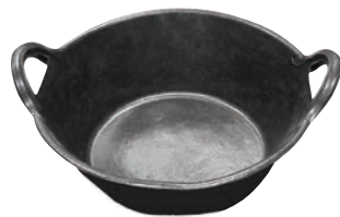
RT00253 3 GALLON RUBBER PAN WITH HANDLES

Made of safe, soft rubber. Features strong eyelets for hanging and reinforced rim.