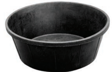
RT00250 15 GALLON RUBBER PAN L 25.88" x W 25.88" x H 9.88"

General purpose pan. Made of safe, soft rubber. Features reinforced rim.