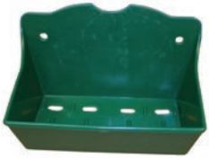
DT00114 1 QUART SALT BLOCK FEEDER L 9.31" x W 6.06 x H 5.56"

Double-Tuf™ salt block holders and mineral feeders are made of tough, impact resistant, high-density polyethylene which protects against warpage, stress cracks and UV damage. These products help eliminate waste of salt, protein or mineral blocks.