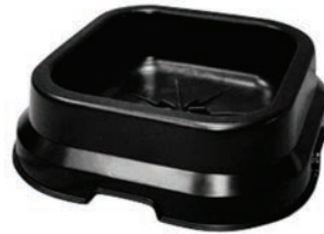
DT00115 10 QUART SALT BLOCK PAN L 18.06" x W 18.06" x H 5.28"

Simplifies measurement and consumption of multiple minerals. Divider for two types of granular minerals. Screw holes for easy installation.