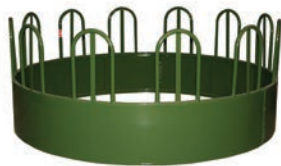
HORSE BALE FEEDER LL21102 HF14 HORSE FEEDER 8' D, 40.5" H

13" hay saver panel and 6" legs. 16 gauge / 2" round tube. 18 feeder openings. Bolt-together assembly.