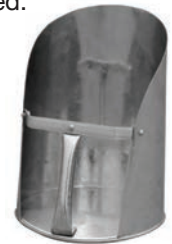
GT00290 3 QUART GALVANIZED FEED SCOOP L 6.38" x W 9.38" x H 8.63"

Heavy-duty galvanized construction to prevent rust and corrosion. Ergonomic handle is easy on your wrist.