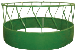
BULL BALE FEEDERS LL21146 BF14 BULL FEEDER 8.6' D, 52.5" H

Double-Tuf™ bale feeders are designed with your animal in mind. The slanted bar design of our bale feeder prevents cattle's ear tags from getting caught. The dimpled bars of our bale feeder add up to 50% more strength while the double dip paint provides better coverage and quality.