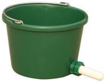
DT00212 8 QUART CALF PAIL L 11.31" x W 11.19" x H 8.13"

The Double-Tuf™ calf pail is made of tough, impact resistant, high-density polyethylene which protects against warpage, stress cracks and UV damage.