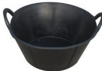
RT00246 6.5 GALLON RUBBER PAN WITH HANDLES

General purpose pan. Made of safe, soft rubber. Features reinforced rim and handles for easy carrying.