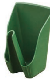
DT00130 3 QUART FEED SCOOP L 10.44" x W 6.81" x H 5.87"

The Double-Tuf™ feed scoops feature an ergonomic design which provides easy transitioning of feed.