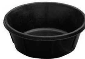
RT00254 3 GALLON RUBBER PAN L 17.25" x W 17.25" x H 5.06"

General purpose pan. Made of safe, soft rubber. Features reinforced rim.