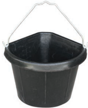
RT00256 20 QUART RUBBER CORNER BUCKET

Features strong wire handle and reinforced rim. Hangs well against any flat surface.