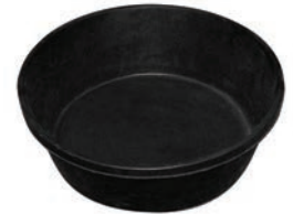
RT00244 8 QUART RUBBER PAN L 14.93" x W 14.93" x H 4.75"

General purpose pan. Made of safe, soft rubber. Features reinforced rim.