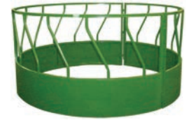
HEAVY-DUTY BALE FEEDERS LL21144 PR14 HEAVY DUTY FEEDER 8' D, 48" H

LL21181 TS68 BALE FEEDER 8' D, 49" H 16 gauge / 1.5" round tube. 18 feeder openings. Bolt together assembly.