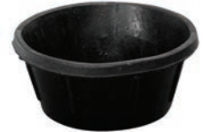
RT00252 2 QUART RUBBER PAN L 8.91" x W 8.91" x H 3.78"

General purpose tub. Made of safe, soft rubber. Features reinforced rim.