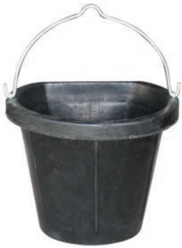
RT00264 18 QUART RUBBER FLAT-SIDED BUCKET