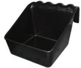
DT00116 UNIVERSAL BLOCK HOLDER L 12.63" x W 14.25" x H 9.69"

Radial ribs protect salt block from water and moisture. Holes allow water to drain. Hand grips for easy handling.